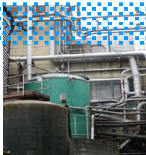
Plastic storage vessel

FMR231 measures reliable in Aggressive Media